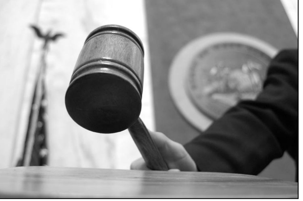
The gavel dropped on Sunday, March 16, signifying the end of the 76th Legislative Session, which was extended for the purpose of working on the state budget.

Not since 1987 have lawmakers had to address a crisis in medical malpractice; but, 2003 proved to be a year in which significant changes were made to stem some problems with the medical crisis.