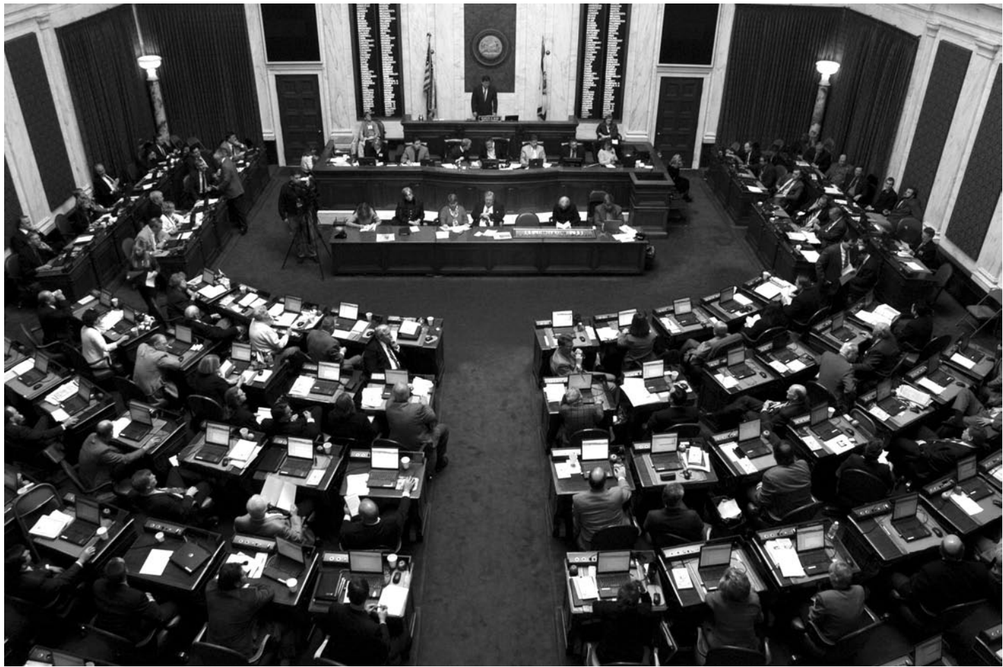
From the West Gallery in the House Chamber, constituents can closely follow the progress of the Legislature

New River Community and Technical College is a newly-named Community and Technical College comprised of components of Bluefield State College, the Center for Higher Education and Work Force Development at Beckley. The bill also headquarters the New River Community and Technical College in Beckley with administrative links to Bluefield State College. By Dec. 31, 2004, if New River Community and Technical College is not independently accredited, the Policy Commission can designate it as an independent community and technical college or merge it with another institution. The Bluefield State College President will appoint a provost to head New