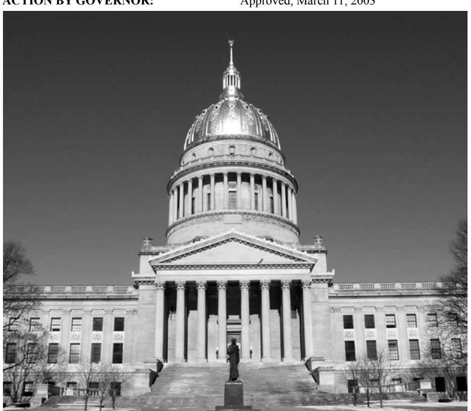
The state capitol building serves as the nerve center for all Legislative operations.

WRAP-UP is a publication of: The West Virginia Legislature's Reference and Information Center State Capitol Complex Building 1, Room MB 27 Charleston, WV 25305 (304) 347-4836