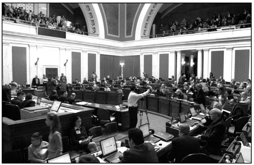
While members of the Legislature reach their decisions on the floor of the Chambers during the 60-day session, a good deal of their time has been spent in retreiving information from interim studies, town meetings and continued constituent contact.

The Speaker and the President also approve the dates of the monthly three-day meetings and the scheduling times of each meeting. Because lawmakers often invite experts and or national consultants to offer suggestions to committee members, traveling expenses for guest speakers may also approved by legislative leadership.