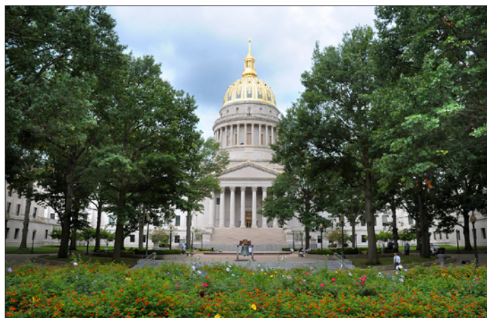
MARTIN VALENT WEST VIRGINIA LEGISLATURE

of $676,000 to allow for the expenditure of other gifts, grants or donations the office may receive.