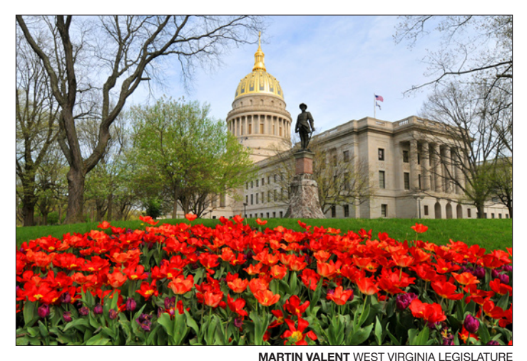
Spring tulips bloom on the State Capitol's South lawn.

Teachers will receive $1,488 base pay increase while school service personnel will receive a 2 percent bump in salary. Additionally, other public employees, such as university staff, will also receive a 2 percent spike. State police will get a $970 raise, whereas the Division of Natural Resource officers will experience an increase